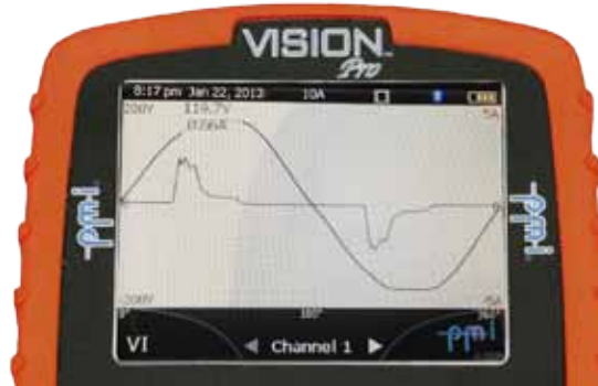
Figure 2. Output from 100W Incandescent Standard Lamp

Our present kW demands are already straining our electrical infrastructure, and adding more and more