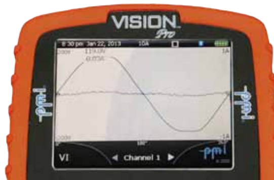
Figure 3. Output from 2.5W Light Emitting Diode Lamp

non-linear loads will only add to this concern. However, the LED technology is developing into a suitable product for us all to reduce our kW demand and as these lamps become less expensive to make, demand for them will make them a more practical choice, to reduce our carbon emissions.